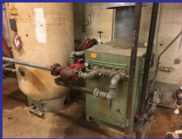
Hot water heater rusted, beyond design life, in need of replacement