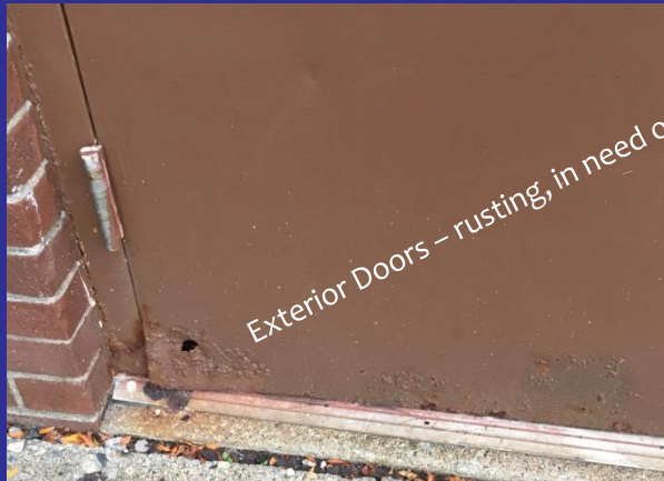
Exterior Doors – rusting, in need of replacement