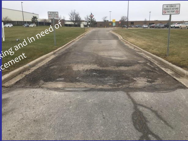
Service drives cracking and in need of replacement