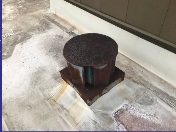
Exhaust fan replacement needed and roofing repairs necessary.