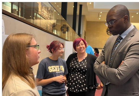
Meeting with Lt. Governor Gilchrist