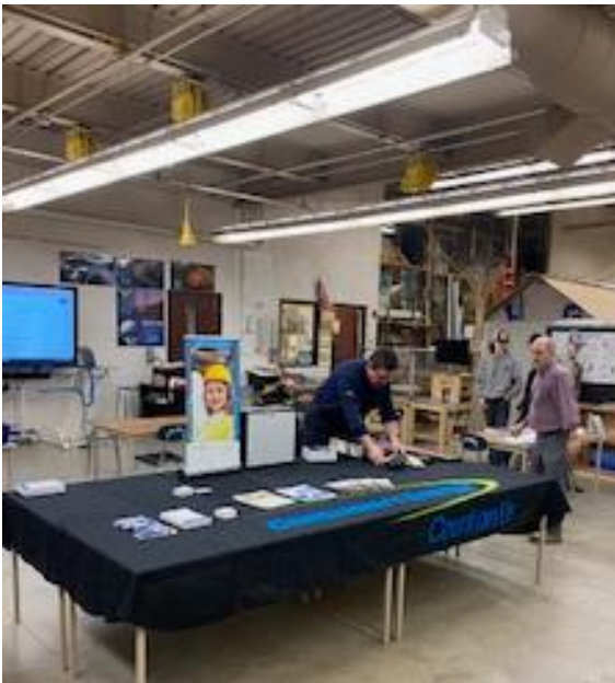
Consumers Energy Booth

Career Technology Education Night: On Tuesday, January 10, 2023 the high school hosted its annual CTE night to highlight the different classes and clubs that are offered in the department. Eleven different colleges and community partners including: Consumers Energy and Brighton Ford attended. They were able to share with parents and students a variety of opportunities that are available after high school through participation in CTE programs. They saw a great turnout. A special thank you goes to our CTE teachers for coordinating this evening.