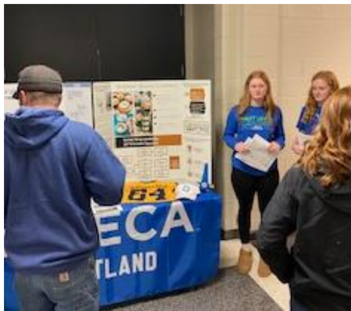
DECA Students share their experiences