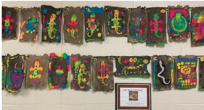
Mexican Bark Painting

Cross Cultural Art Takes Shape: Students at Creekside Elementary are working on cross cultural art projects. They would like to share this with you.