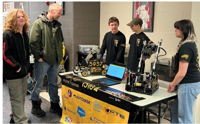
Checking out the robotics programs available in HCS.

Thank you, Hartland and LESA CTE teachers, for the opportunity to learn more about these programs.